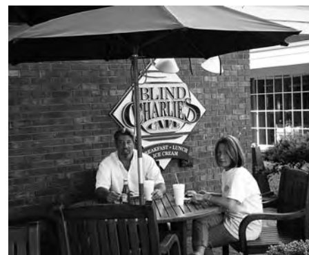
... or on the patio at Blind Charlie's

Scotts Corner Market and enjoy lunch in the courtyard at Trinity Corners. 764-5736