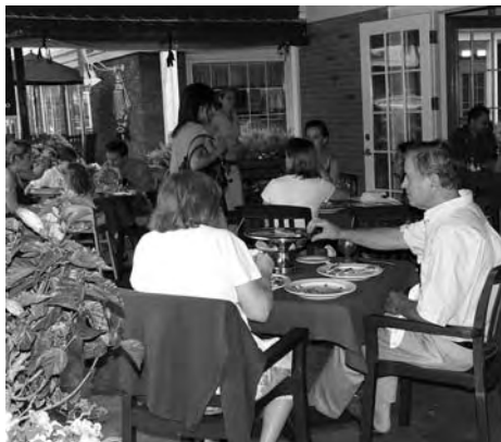
Under the awning at DiNardo's, ...

For casual outdoor dining, make your selection at The Fridge