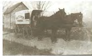
Marshall's butcher's wagon