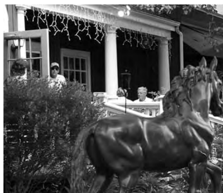
Dining on North Star's porch ...

(764-1224) and relax on one of the park benches at the fountain and throughout Scotts Corners.