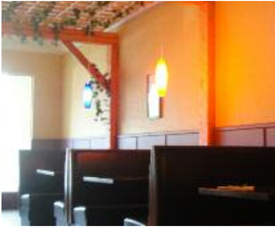
Warm colors and welcoming decor make dining at Asia Hamachi a delicious and delightful experience!