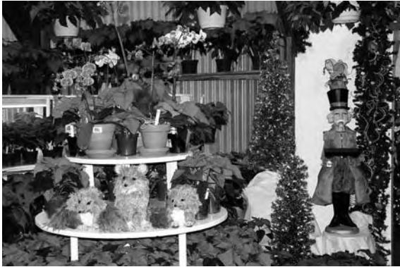
December bursts into bloom at Poundridge Nurseries

Look no further than our local shops for your holiday merry making, food and other party necessities!