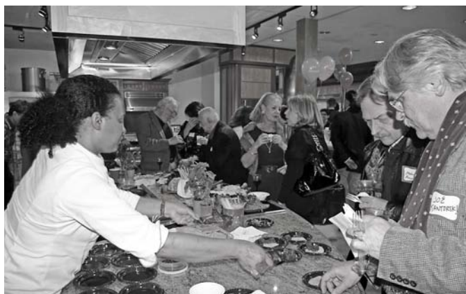
Guests sample a wide variety of foods prepared on state-of-the-art appliances, cookware and grills showcased at Albano's .

A wide variety of food was prepared “live” on the very latest indoor and outdoor cooking equipment from manufacturers such as Alfresco, Kalamazoo, Lynx, Miele, Viking and Wolf.